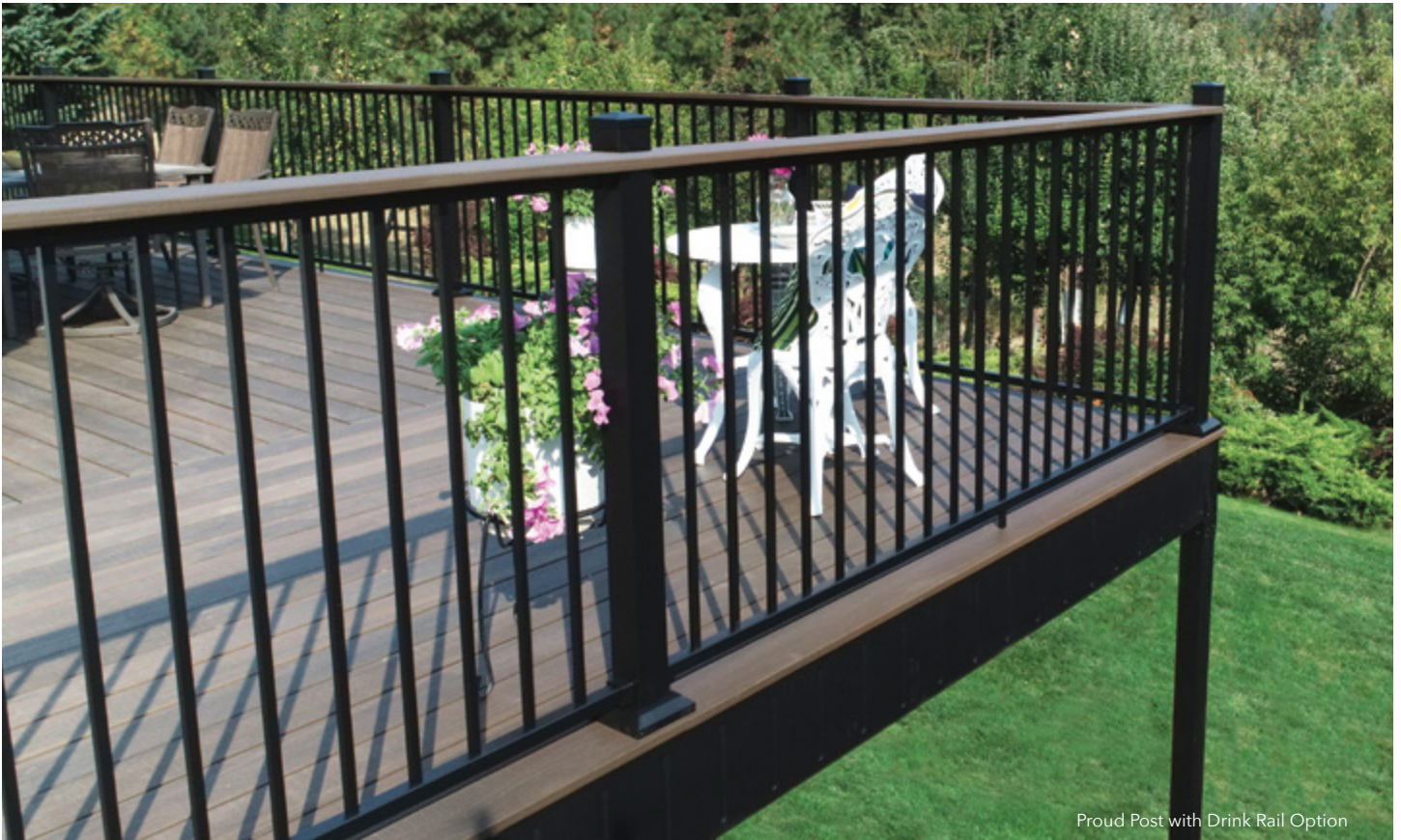
Proud Post with Drink Rail Option

ITEM# 660368 (BLACK SAND) ITEM# 660364 (MATTE WHITE)